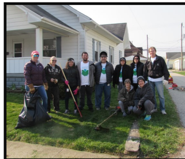
2018 Day of Service Volunteers