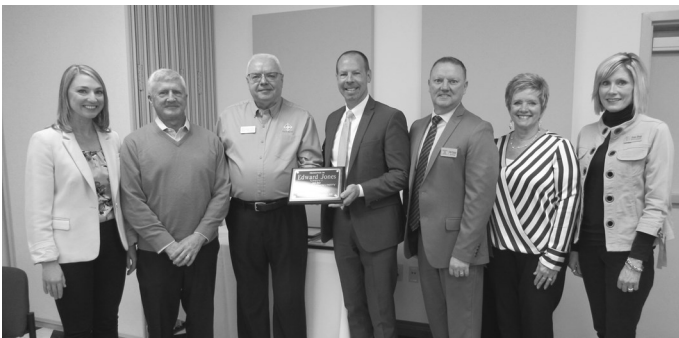
Edward Jones of Lebanon received the Spirit of Community Award for their long-standing service to BCSSI and the Foundation.