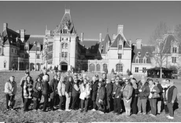
No this isn't the Hallmark Channel... Just our BCSSI Travel Group starring in their own version of "A Biltmore Christmas." Turn to page 11 for more details on the next Travel Group trip.